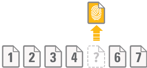
Figure 1: Unity Active Archive’s unique file serial numbers enable easy identification of missing files.